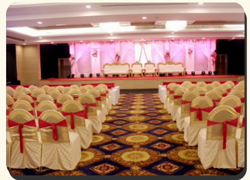
Auditorium - I & II