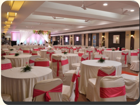
Aura - I & II