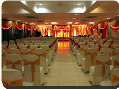
Euphoria - I & II