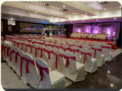
Sapphire - I & II