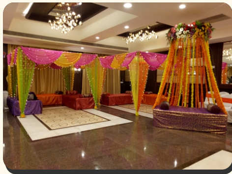
Sterling - I & II